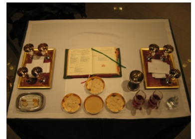
Placement of Gifts on Altar

Sometimes there are no hosts for homebound ministers. On those occasions, the placement of items on the altar is exactly the same, except that the tray with hosts for homebound ministers is not present.