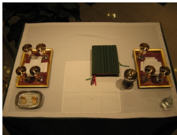
Cross Bearer brings Sacramentary (this can happen anytime after Cross Bearer lights candles)