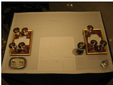
Candle Bearers bring both trays of cups at same time (tray with three cups goes next to chalice)